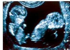
Ultrasound of twins at 11 weeks.

TWINS, as our client in the above story is having, can be either identical or non-identical (fraternal). Identical twins occur once in about 300 births, while the incidence of non-identical twins varies widely by race and age of the mother.